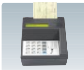
The keyboard and screen layout make the e N -Check 3000 easy-to-use.