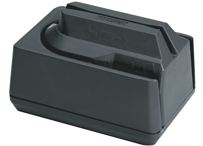
Mini MICR with MSR