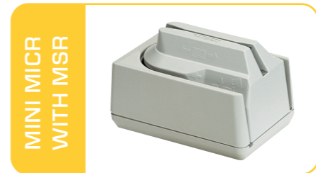
MINI MICR WITH MSR