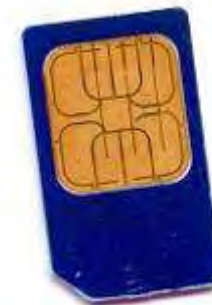
SIM Card Example

SIM (Subscriber Identity Module) card is a "smart card" for GSM/GPRS mobile technology that contains the users account profile. Network information and Account services are stored on the SIM card.