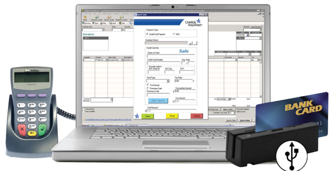
CHARGE Anywhere® with QuickBooks® Financial

Available for QuickBooks® Pro, Premier and Enterprise versions 2005, 2006, 2007, 2008 and 2009!