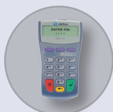
VeriFone PP 1000SE