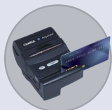
P25 Bluetooth Printer and MSR