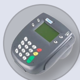
Ingenico i6580/i6780 (Sig Capture)